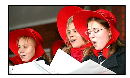
2018 Holly Dickens Festival Dates:

December 2,8th& 9th Saturdays: 11:00 am - 6:00 pm Sundays: 12:00 noon - 5:00 pm In Battle Alley, Holly, Michigan